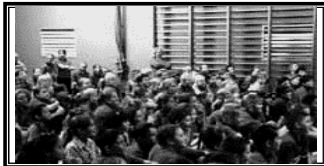
Rolling Hills School, Melbourne Australia – Easter Program